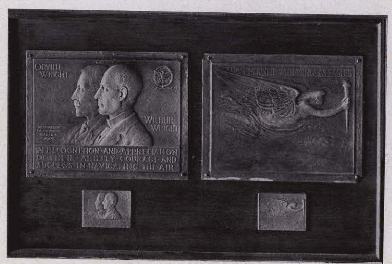
Nos. 19, 20