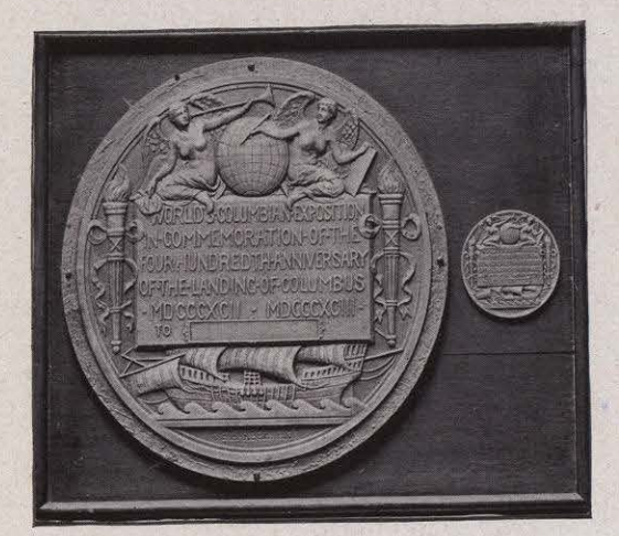
Nos. 23, 24