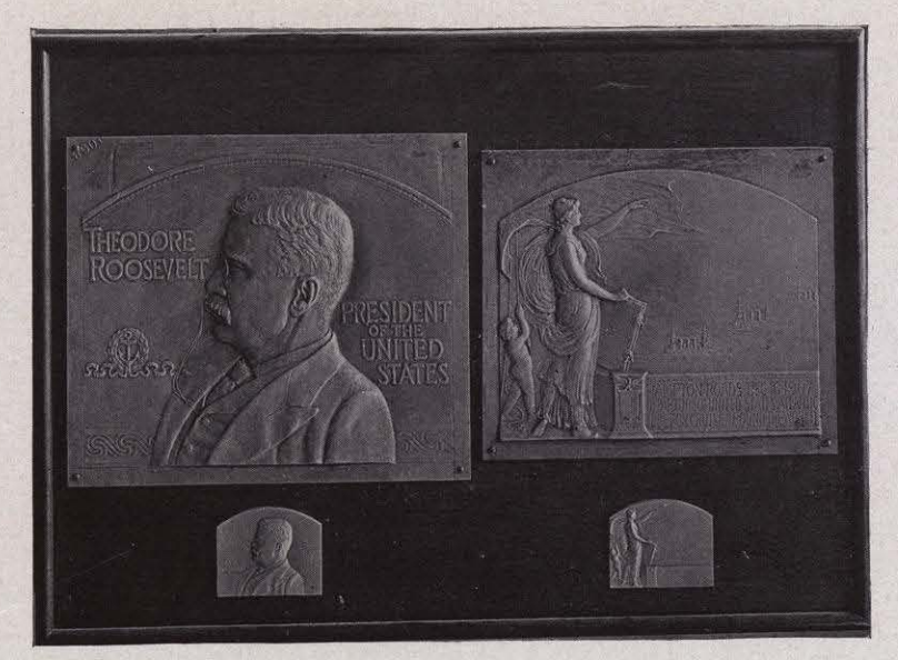
Nos. 7, 8