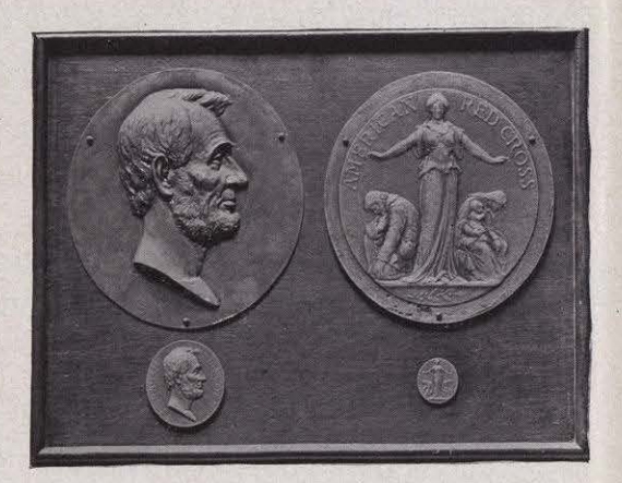
Nos. 1, 2, 3, 4