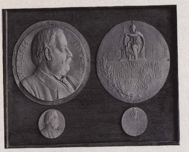
Nos. 13, 14