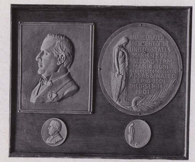
Nos. 21, 22