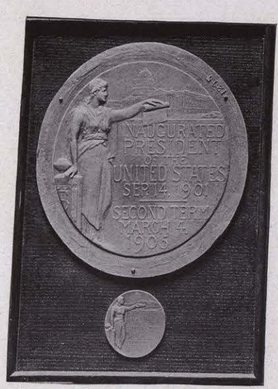
Nos. 11, 12