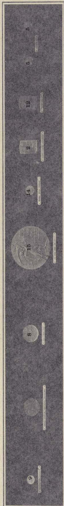
Nos. 2, 5, 9, 12, 14, 15, 18