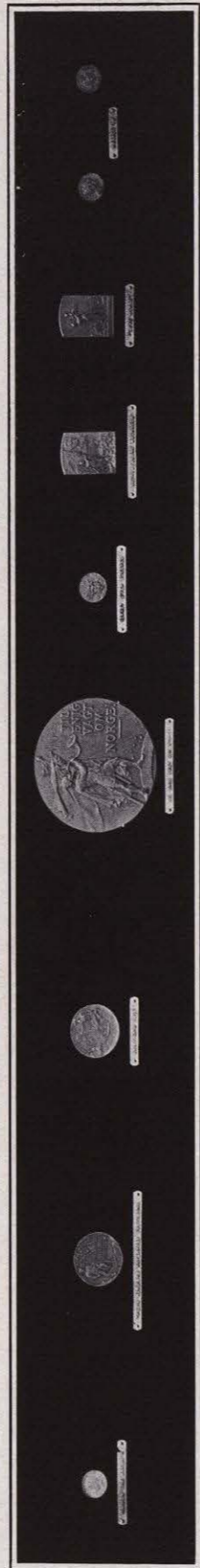
Nos. 2, 5, 9, 12, 14, 15, 18