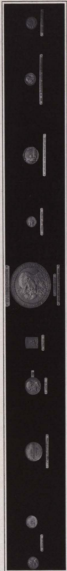
Nos. 6, 8, 10, 11, 13, 16 (Rev.), 17