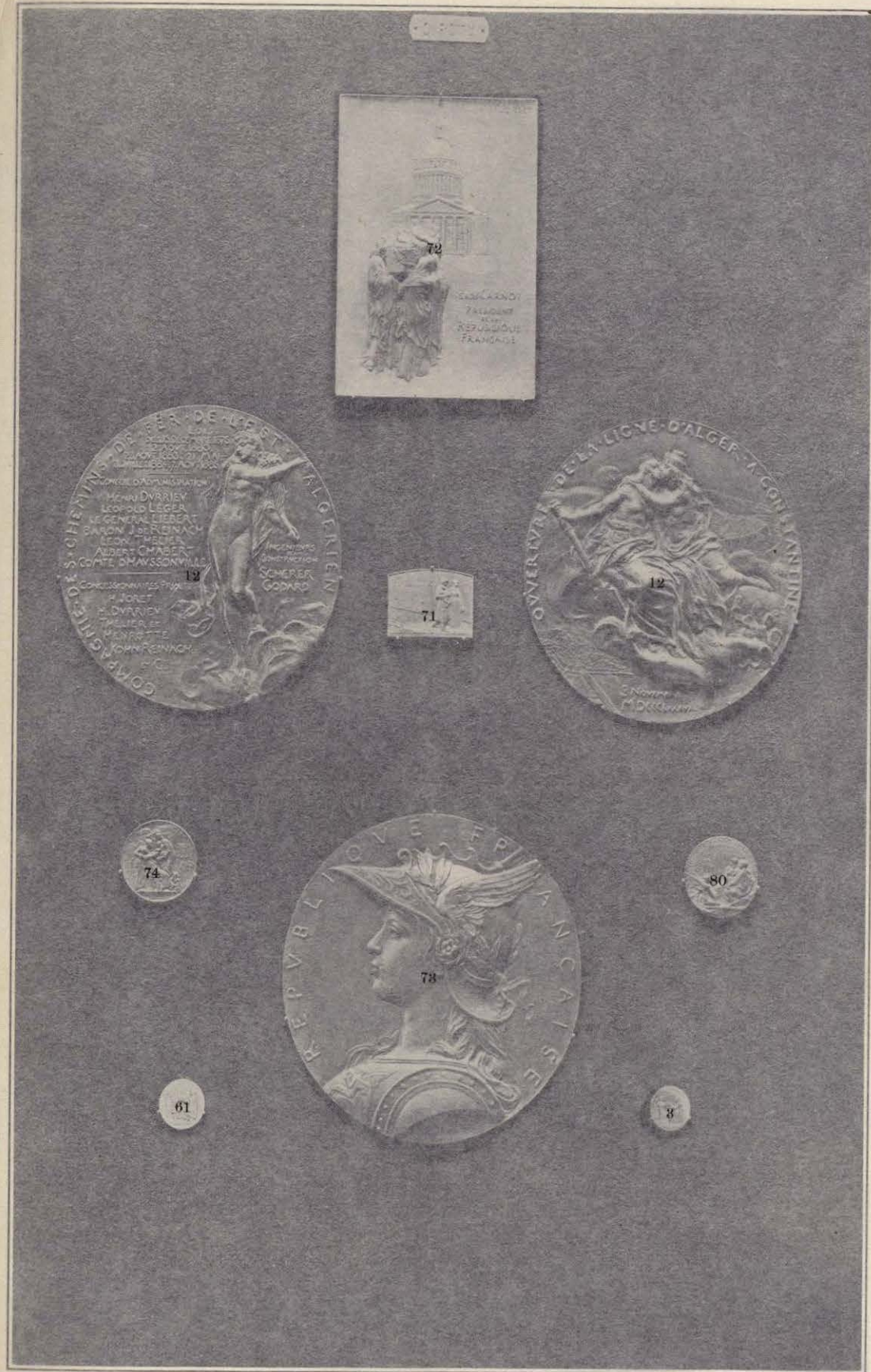
Models for Nos. 12, 72, 73; also Nos. 71, 80 (Belonging to American Numismatic Society and exhibited apart from the other numbers)