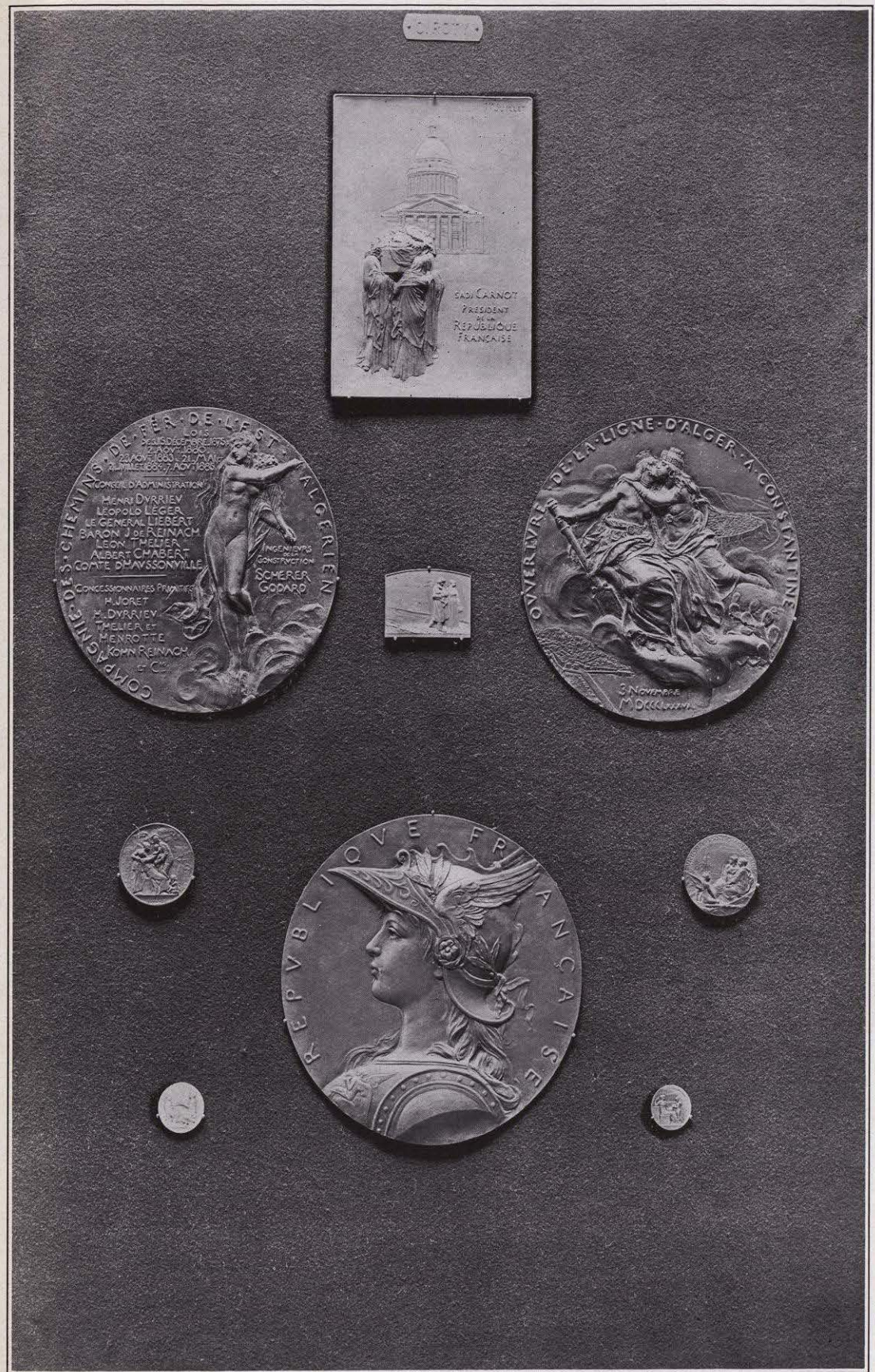
Models for Nos. 12, 72, 73; also Nos. 71, 80 (Belonging to American Numismatic Society and exhibited apart from the other numbers)