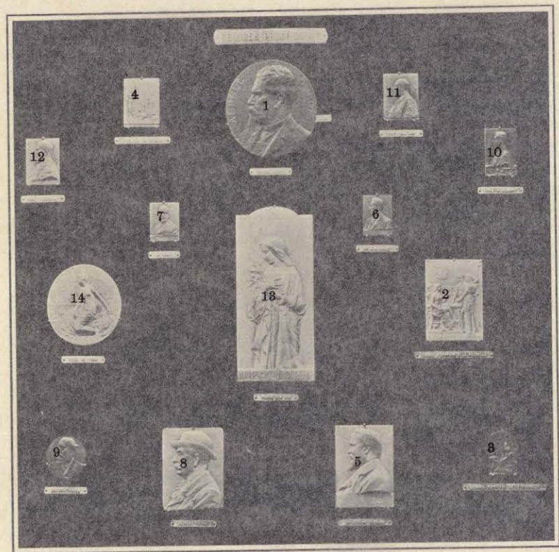
Nos. 1, 2, 3, 4, 5, 6, 7, 8, 9, 10, 11, 12, 13, 14