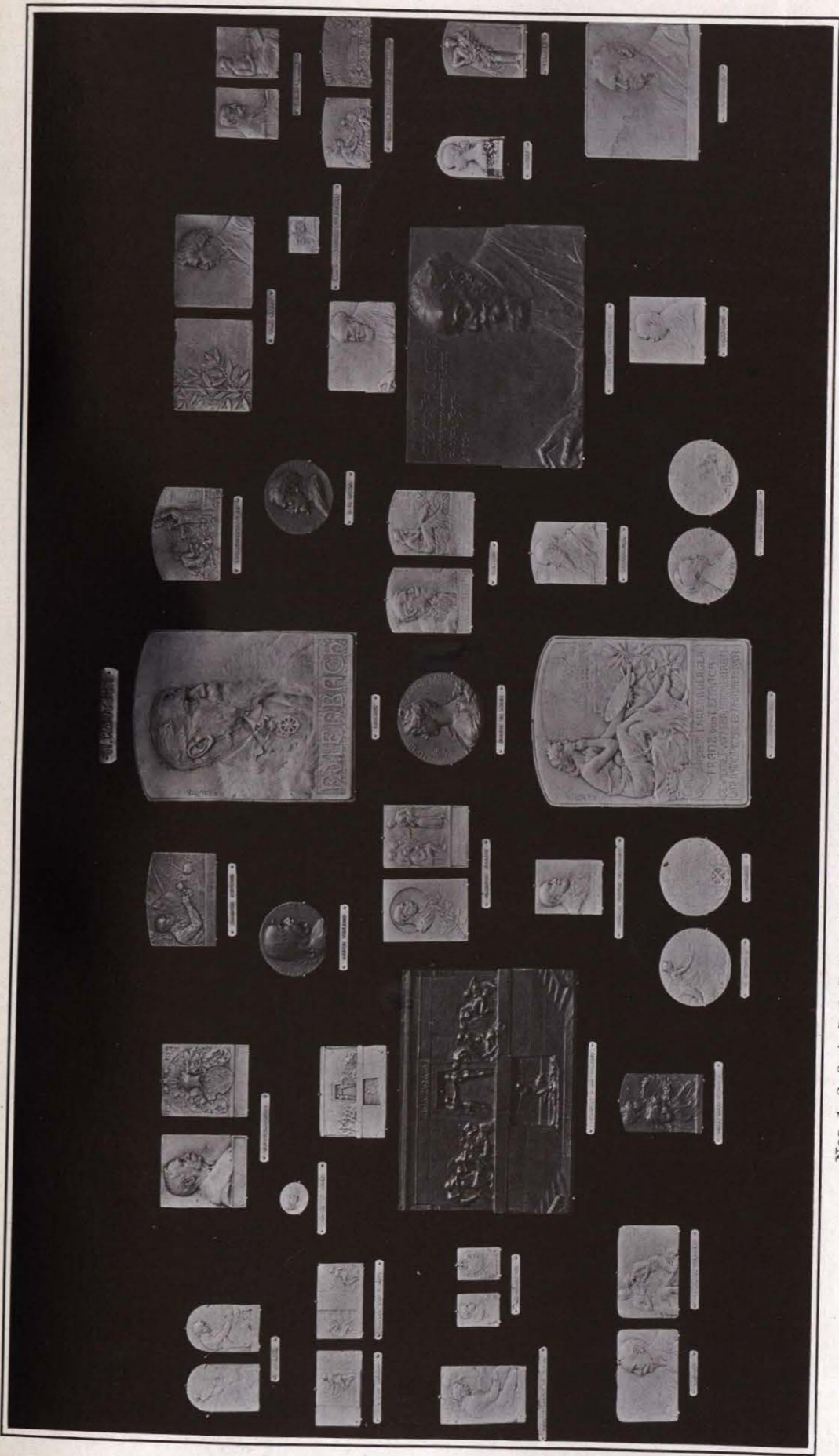
Nos. 1, 2, 3, 4, 5, 6, 7, 8, 9, 10, 11, 12, 13, 14, 15, 16, 17, 18, 19, 20, 21, 22, 23, 24, 25, 26, 27, 28, 29