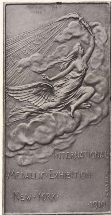
Commemorative Plaquette by M. Godefroid Devreese, 1911.